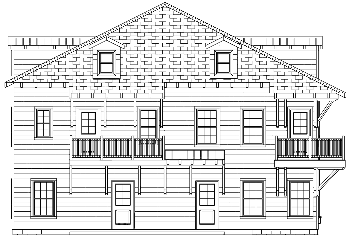
UNIT 16 - MODEL D-1 FRONT ELEVATION UNIT 17 - MODEL D-2