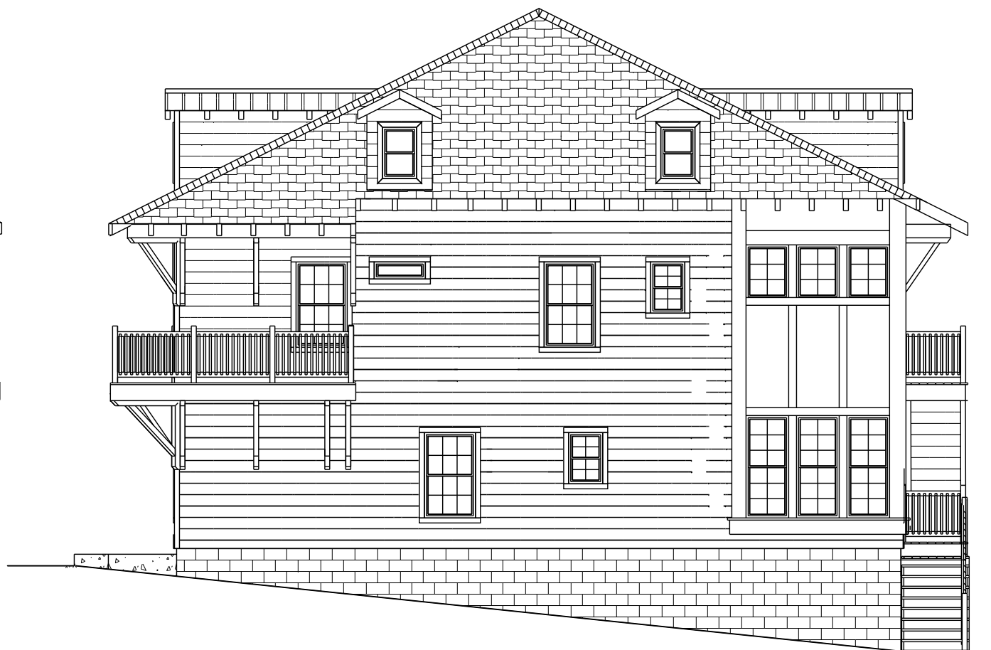
UNIT 12 - MODEL D-2(f) LEFT ELEVATION