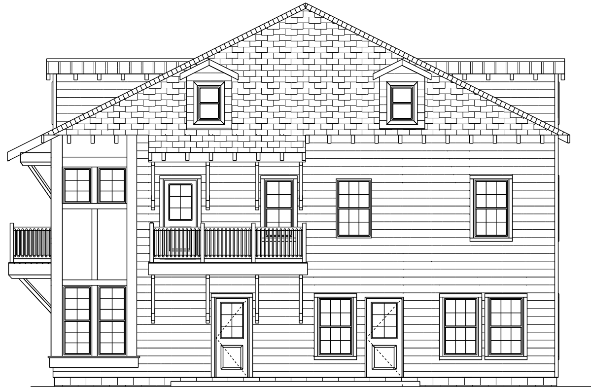
UNIT 12 - MODEL D-2(f) FRONT ELEVATION UNIT 13 - MODEL D-1(f)