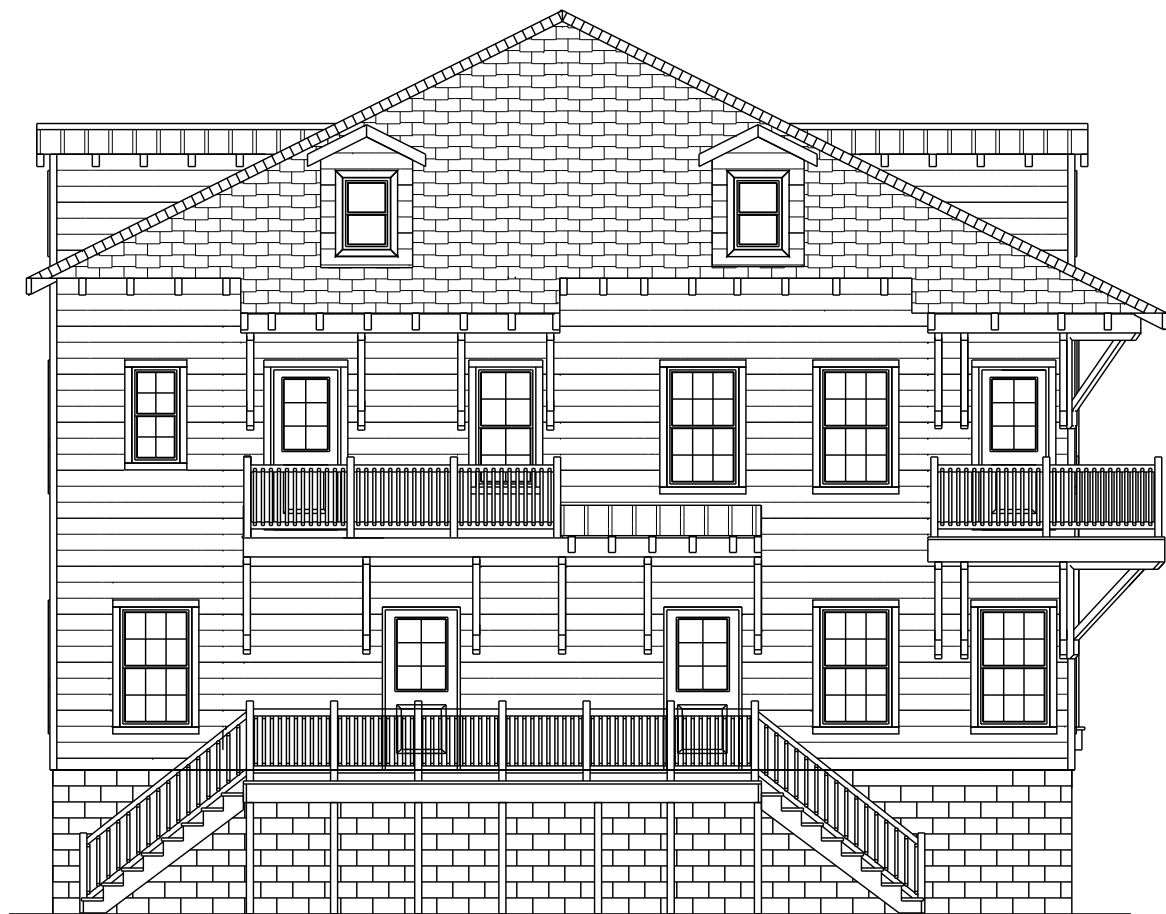
UNIT 13 - MODEL D-1(f) REAR ELEVATION UNIT 12 - MODEL D-2(f)