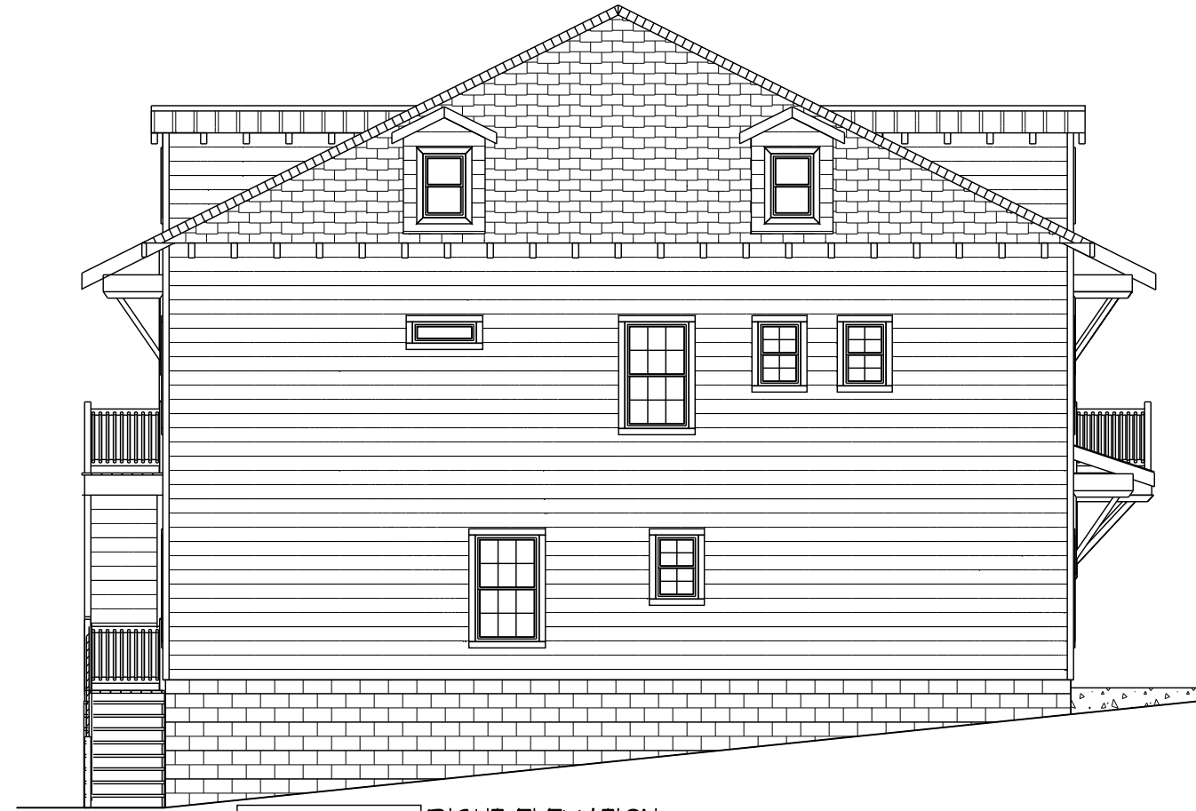
UNIT 13 - MODEL D-1(f) RIGHT ELEVATION